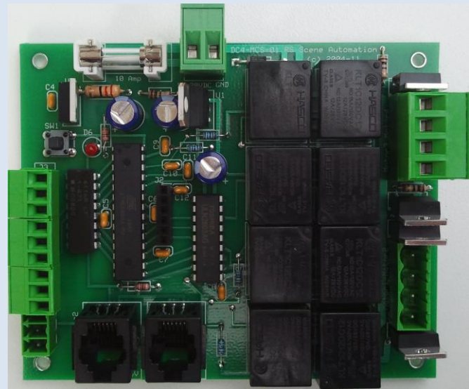
Figure 2: DC4-MCS